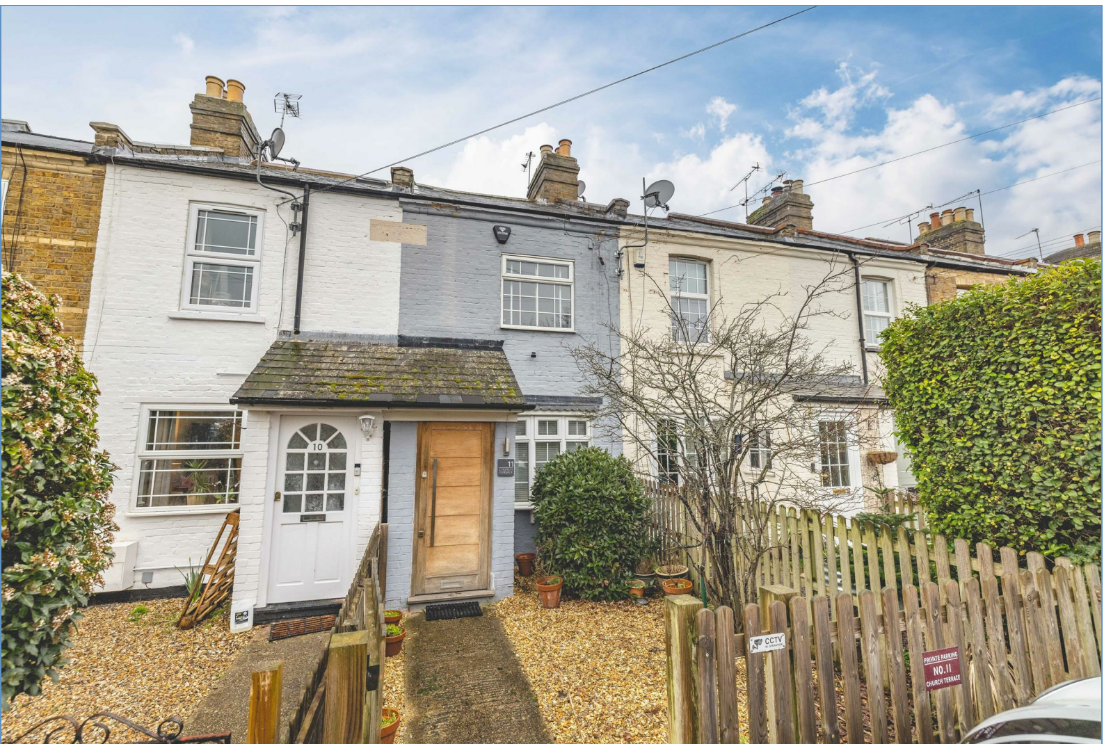
11 Church Terrace, Windsor, SL4 4JG £399,950

Nestled in the charming area of Church Terrace, Windsor, this beautifully presented mid-terrace family home is now available to the market with no onward chain. This delightful property features two generously sized bedrooms, making it an ideal choice for families or those seeking extra space. The spacious bathroom is well-appointed, ensuring comfort and convenience for all residents.